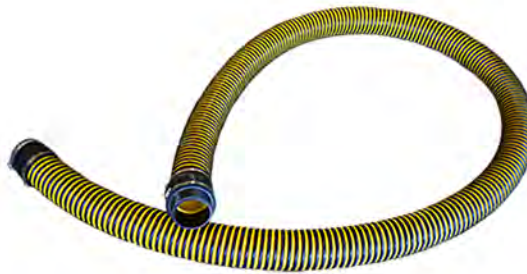
Heavy Duty Hose w/ Camlocks 10': 56-16055 15': 56-16056