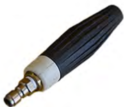
PV Dig Nozzle 3000 PSI: 61-01015 4000 PSI: 61-01016