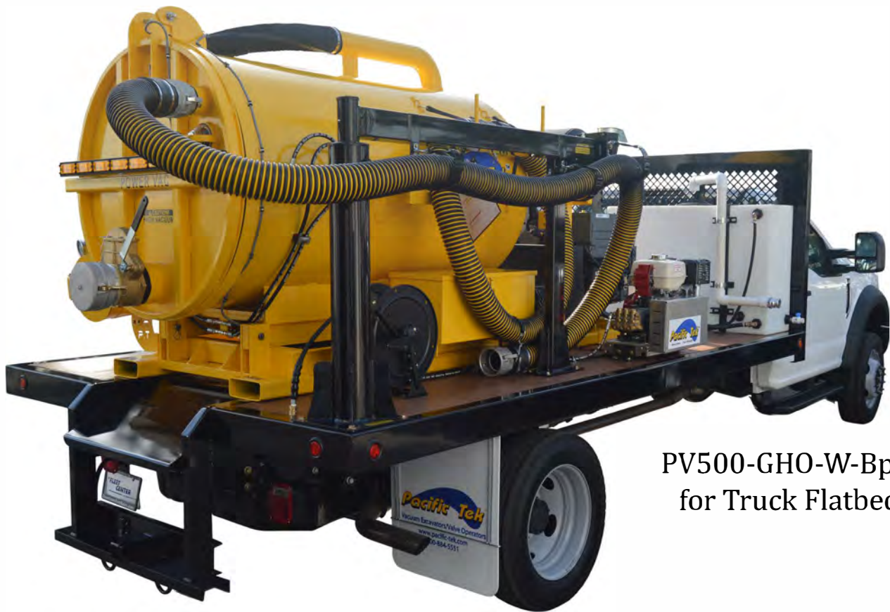
PV500-GHO-W-Bp-S for Truck Flatbed