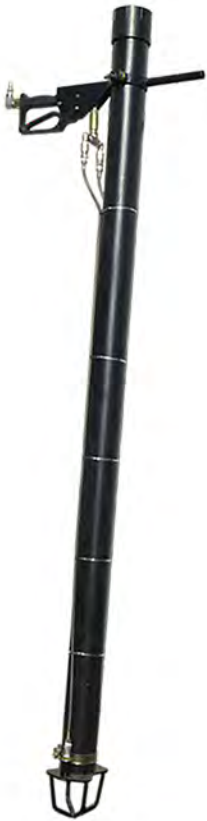
DSB Wand 4": DSB-6-4 3": DSB-6-3