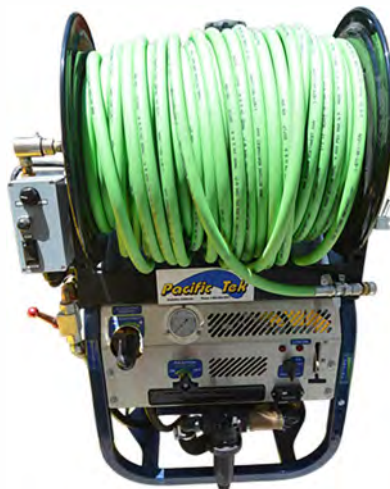
12 GPM @ 3000 PSI Sewer Jetter