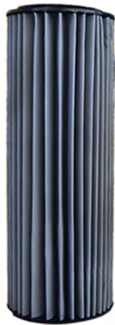
Vacuum Filter Small Filter: 51-11001 Large Filter: 53-13002