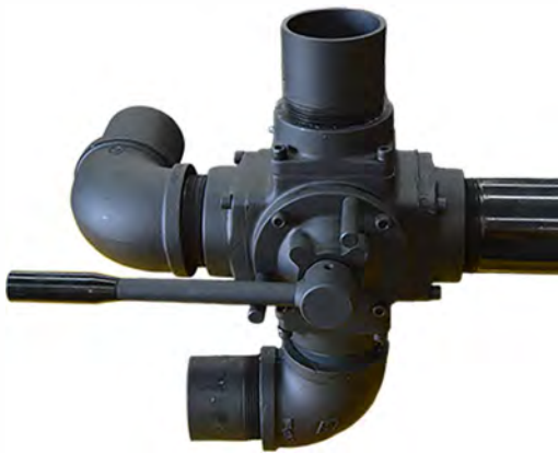
Vacuum Reverse Flow