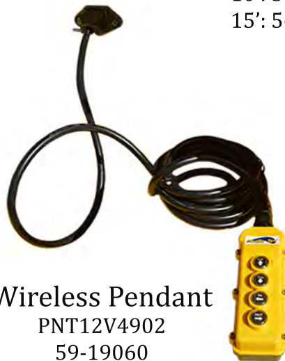
Wireless Pendant PNT12V4902 59-19060