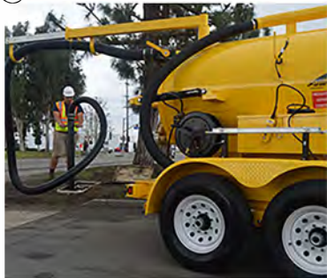
Power Vacs at work (Potholing)