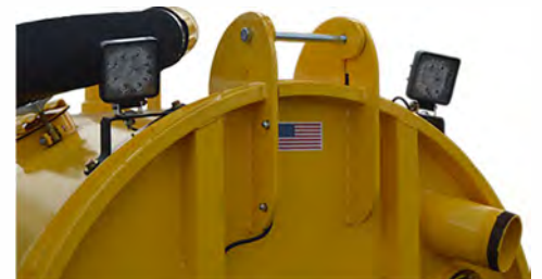
LED Light Kit